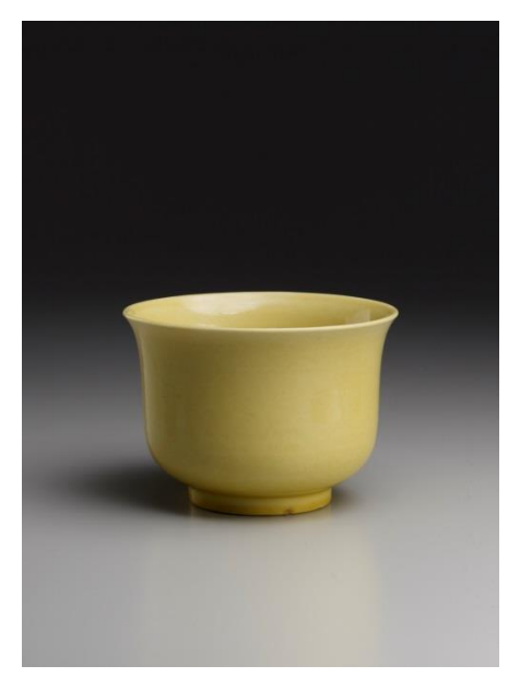
A FINE AND EXTREMELY RARE YELLOW-ENAMELLED BOWL XUANDE INCISED SIX-CHARACTER MARK WITHIN A DOUBLE CIRCLE AND OF THE PERIOD (1426–1435) 6 in. (15.2 cm.) dian. HKS26,000,000-35,000,000

TO LEAD THE NOVEMBER SALE OF CHINESE CERAMICS & WORKS OF ART